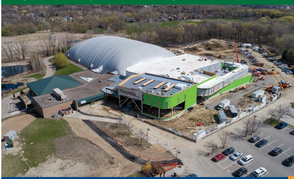
The Plymouth Creek Center has a new name — introducing the Plymouth Community Center. As the facility undergoes a major renovation and expansion project, the Plymouth City Council approved the name change to better represent the purpose of the building. The new facility is designed to offer a broader range of activities, spaces and amenities for everyone in the community to enjoy. For more information about the construction project and the future of the facility, visit plymouthmn.gov/pccproject.