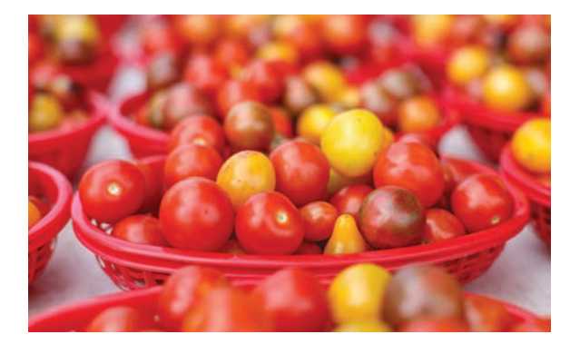
The Plymouth Farmers Market runs each Wednesday, June 23 through Oct. 6, at the Parkers Lake Playfield parking lot.

Because Ramon and Linda volunteer, dog owners have more convenient access to bags at parks, trash and yard waste is kept from entering storm water systems, and firefighters can assist residents quickly in case of an emergency.