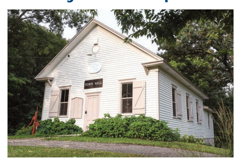
The Plymouth Historical Society operates out of the old Town Hall building located at 3605 Fernbrook Lane N.