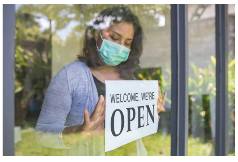
Plymouth Economic Development staff work with other regional agencies to connect businesses with resources for recovery, growth and getting started.

Learn more about the program and register at elevatebusinesshc.com.