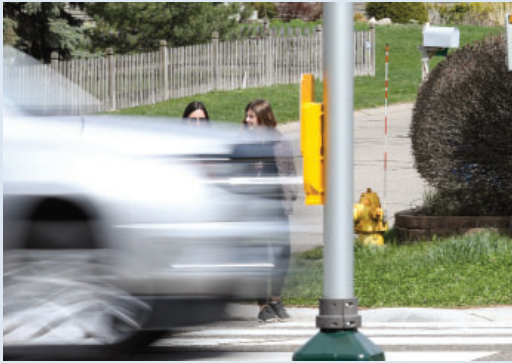
The Plymouth Public Safety Department offers reminders for pedestrians and motorists sharing the road.

For additional resources to help reduce organic waste, visit plymouthmn.gov/organics .