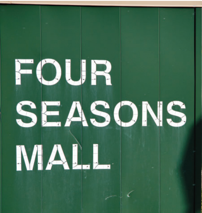
The City of Plymouth purchased the Four Seasons Mall site in late-June in order to facilitate a redevelopment project at the location.

In all instances, project funding and/or the challenging nature of the site caused plans to fall apart before any work began. Because of these difficulties, the city moved