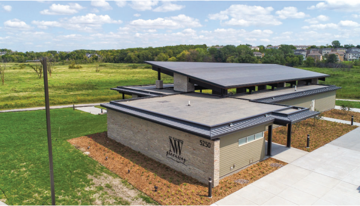
The new pavilion serves as a trailhead for the Northwest Greenway and offers a plaza, parking, restrooms and more.

The City of Plymouth will host a ribbon cutting ceremony to celebrate the completion of the Northwest Greenway