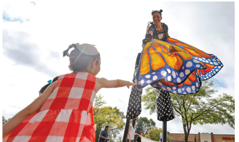
The annual Plymouth on Parade returns this year with a new, redesigned route in the heart of City Center. The event is set for Saturday, Sept. 18.

Residents are encouraged to post parade photos on Facebook, Instagram and Twitter by tagging the city or using the hashtag #PlymouthonParade for a chance to be shared by the City of Plymouth.