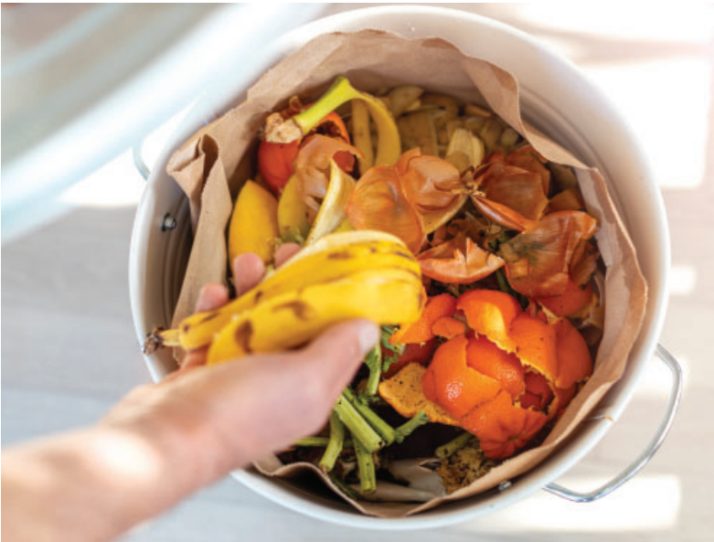
Beginning in 2022, all licensed garbage haulers in Plymouth must provide the option for curbside organics collection, which offers another way for residents to reduce waste.