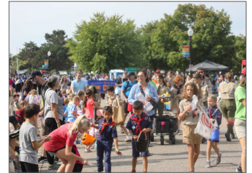
PLYMOUTH ON PARADE