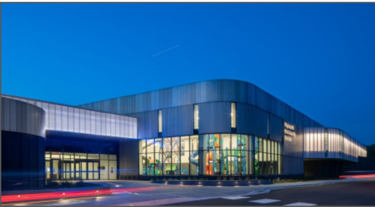
PLYMOUTH COMMUNITY CENTER