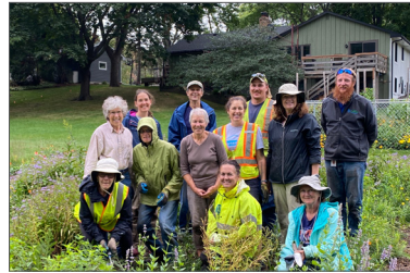
FAZENDIN PLANTING VOLUNTEERS