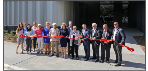
PLYMOUTH COMMUNITY CENTER RIBBON CUTTING